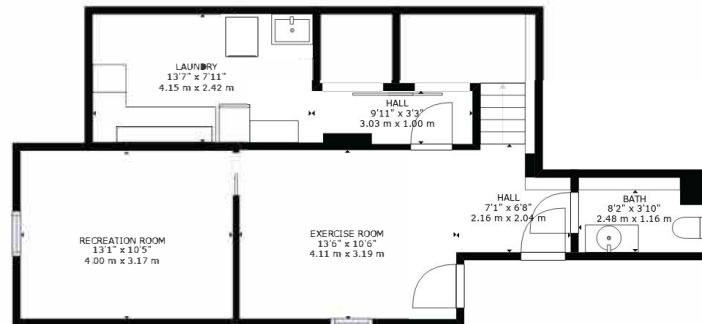
FLOOR 1 - LOWER LEVEL