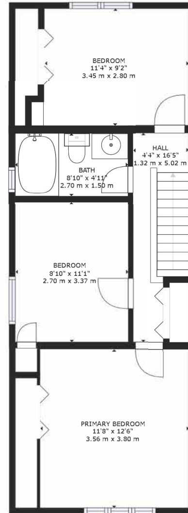
FLOOR 3 - UPPER LEVEL