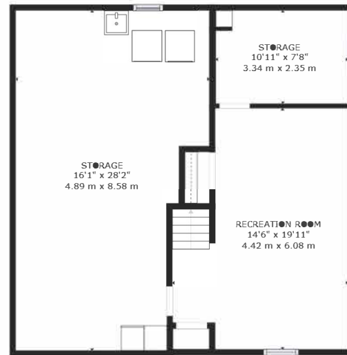
FLOOR 1 - LOWER LEVEL