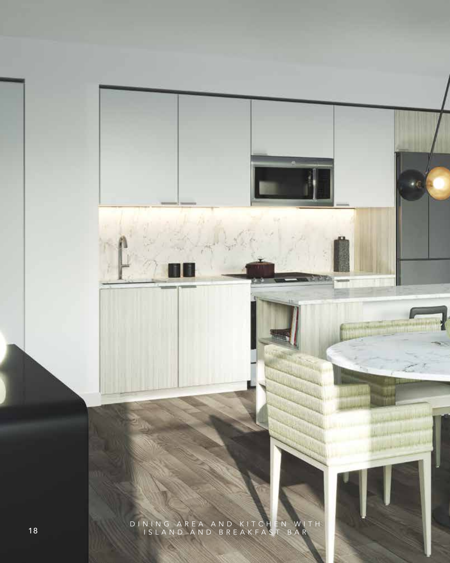
DINING AREA AND KITCHEN WITH ISLAND AND BREAKFAST BAR