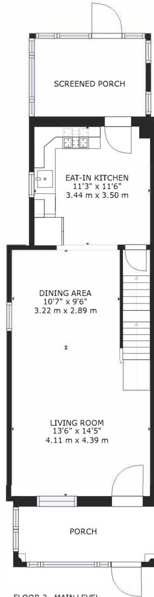
FLOOR 2 - MAIN LEVEL