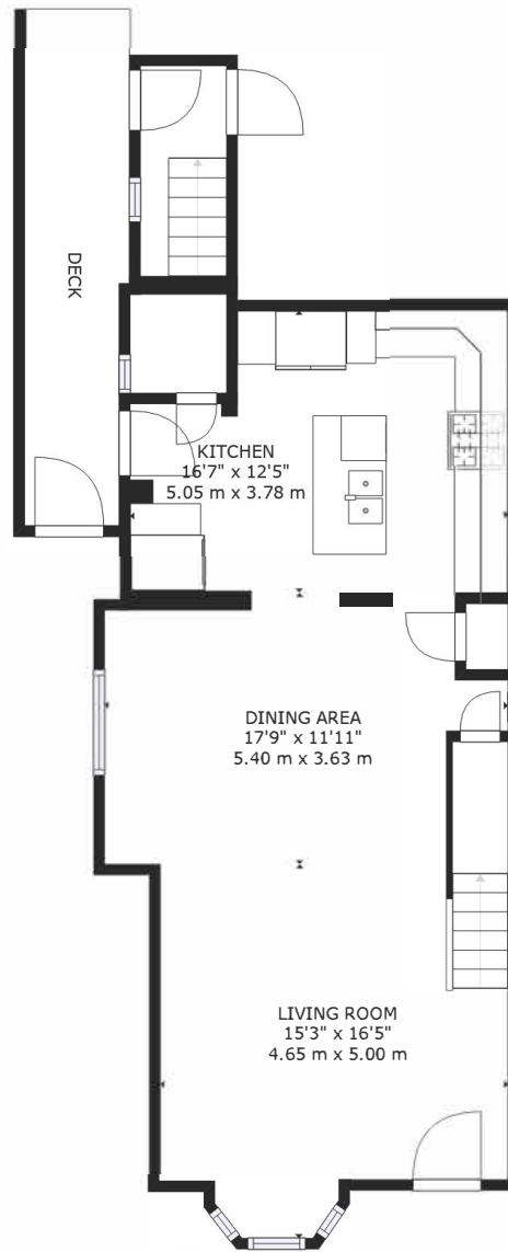
FLOOR 2 MAIN LEVEL